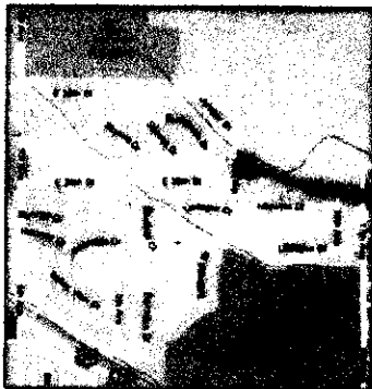
Project Site Vicinity Map Not to Scale